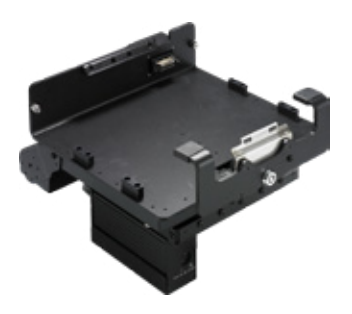
Vehicle Dock W x D x H: 348 x 310 x 215mm (13.70" x 12.20" x 8.46")