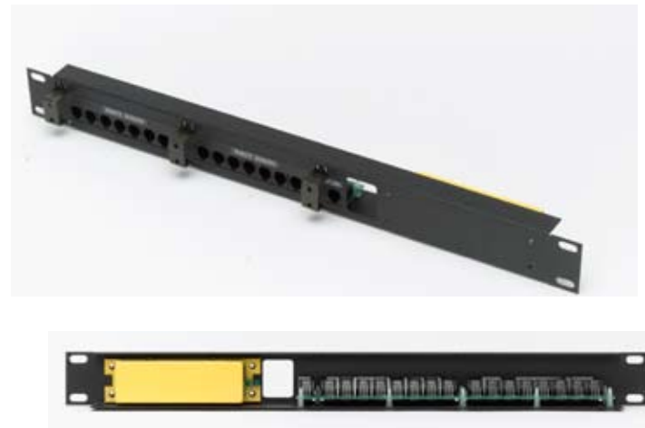
The sixteen port splitter is rack-mounted. The MiniGoose climate monitor installs on the back of the metal enclosure as shown in the bottom photo.

With this rack-mounted splitter, the user can directly plug in up to sixteen sensors, which is the maximum for the MiniGoose. The MiniGoose is not included.